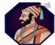
श्री छत्रपती अकॅडमी पुणे